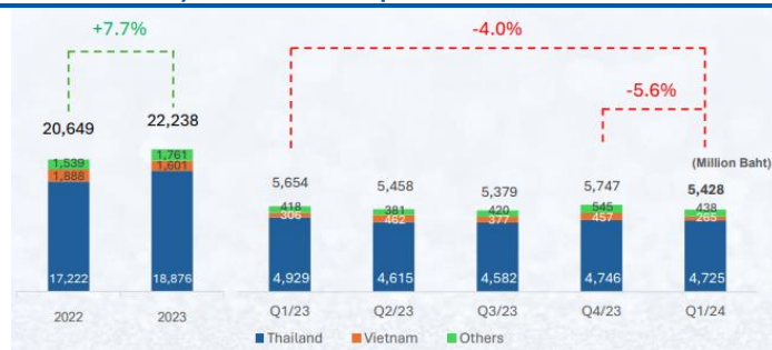
Figure 2: Both Thailand and Vietnam markets slowed down simultaneously with different specific factors