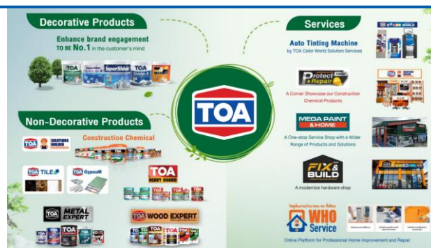
Figure 4: Full scope of products and services