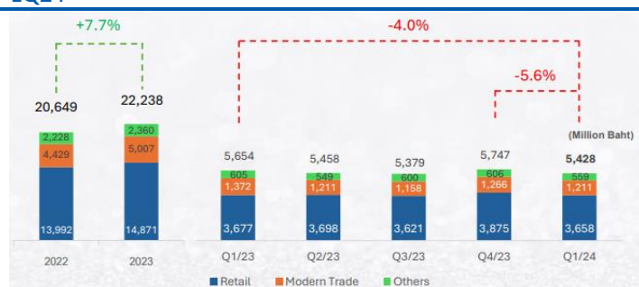
Figure 3: All sales channels contributed lower sales revenue in 1Q24