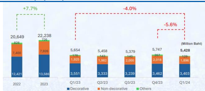
Figure 1: All product segments showed sales revenue declining YoY and QoQ in 1Q24